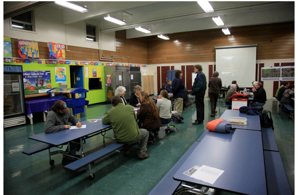
Residents & City officials discuss options for W 24th Avenue at an open house held December 1st .

The project is currently in the design phase. To ensure the project can be completed in summer 2012 it will be advertised for contractor bidding in February. Construction of sidewalk access ramps will occur in spring with paving of the street in summer.